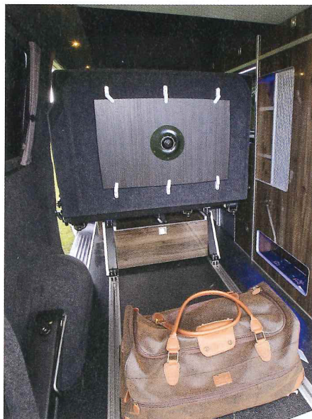
Sliding Reimo seat means BIG loads can be carried