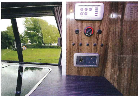
Diesel heating and 12V/230V sockets