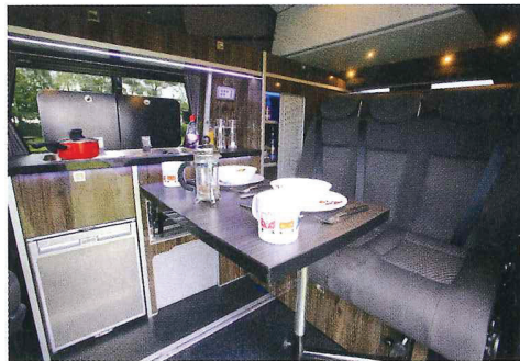
Table slides with the rear Reimo seat