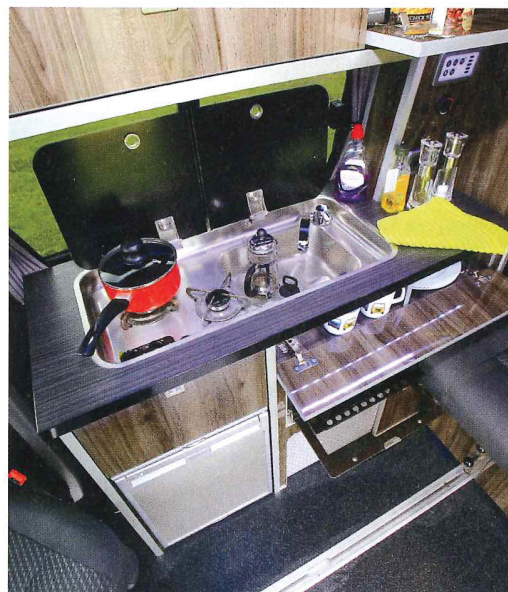
Smart high-gloss furniture gives the Silver Star a plush feel

In turn, there's more storage space in the base of the RIB seat.