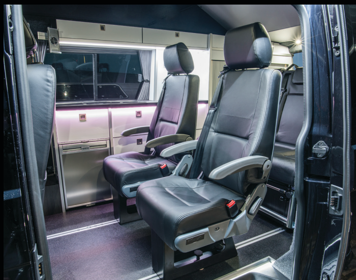
Additional single rear seats can be easily attached to the rails

When it comes to safety there is no compromise and the Variotech seat leads the way where many other seats on the market today fall short! The seat has been through in-chassis testing and complies to the latest European standards. The variotech is one of the only seats on the market which offers 3 seats with integral 3-point belts.