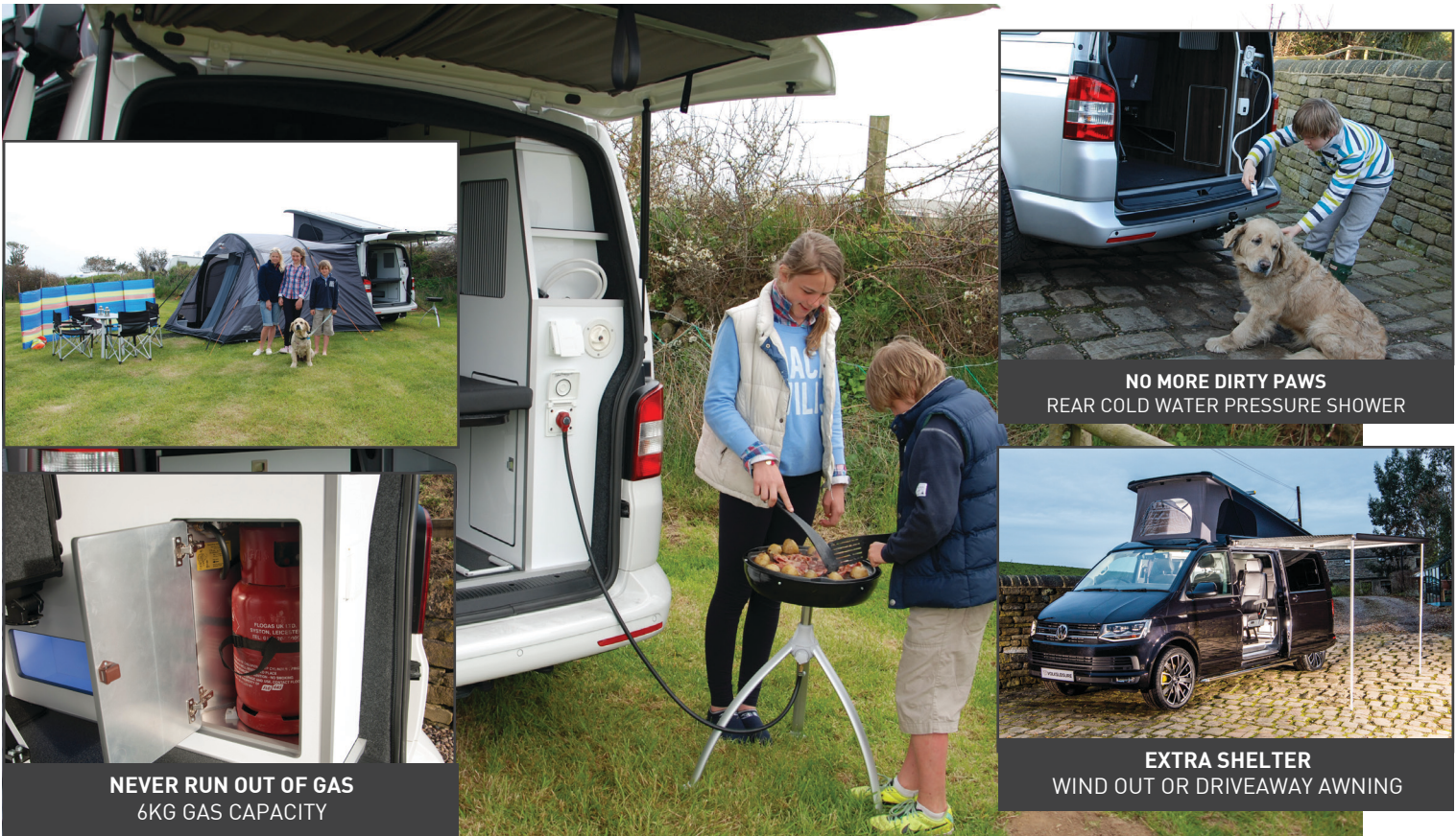
NEVER RUN OUT OF GAS 6KG GAS CAPACITY